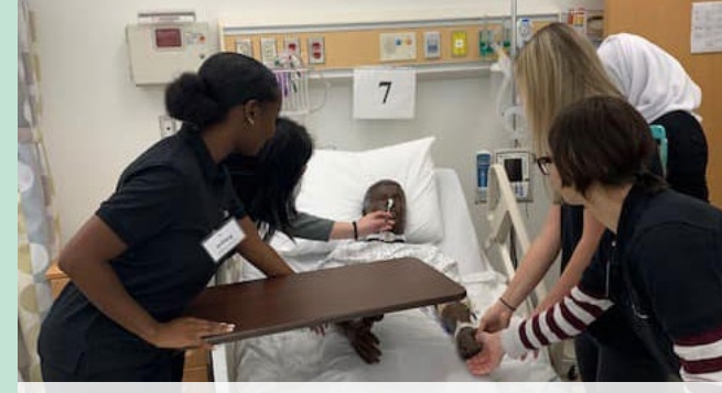
Speech-Language Pathology and Psychology graduate programs worked with nursing students at Notre Dame University of Maryland for a three-hour Communication Simtivity.